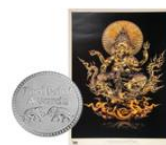
2. พระพิฆเนศวรแห่งความสำเริง 2555 อ.เฉลิมชัย