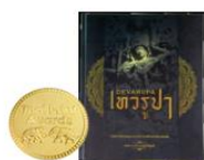
1. เทวรูปประติมากรรมชิ้นเอกในศิลปะฮินดู คุณปวีลรัตน์ รุ่งเรือง