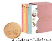
4. หนังสือชุด "บันทึกฝึกซ้อม" เล่ม 1-4 โดยท่านหญิงประสาธน์ มูลนิธิชัยพัฒนา