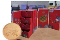
5. Moon Cake MX 4 ชั้น Red บริษัท ฟู้ด ออฟ เอเชีย จำกัด