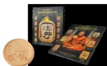
3. พอราฟอปาน บริษัท แอกร้า แร่งคือค จำกัด